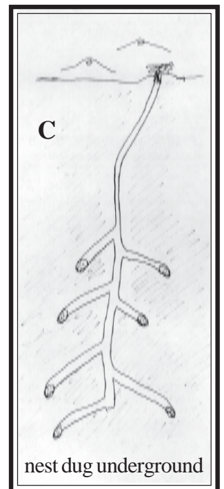
nest dug underground